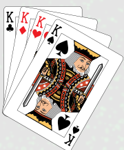
Four-of-a-Kind Pays: 100-1