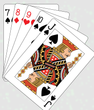
Straight Pays: 9-1