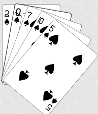
Flush Pays: 15-1