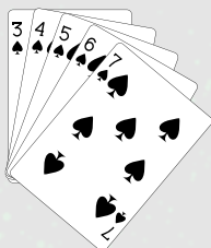
Straight Flush Pays: 200-1