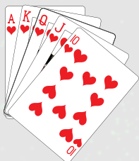
Royal Flush Pays: 1000-1