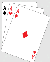
Three-of-a-Kind Pays: 8-1

Cypress Bayou Casino • Hotel A Chittimacha Tribal Enterprise